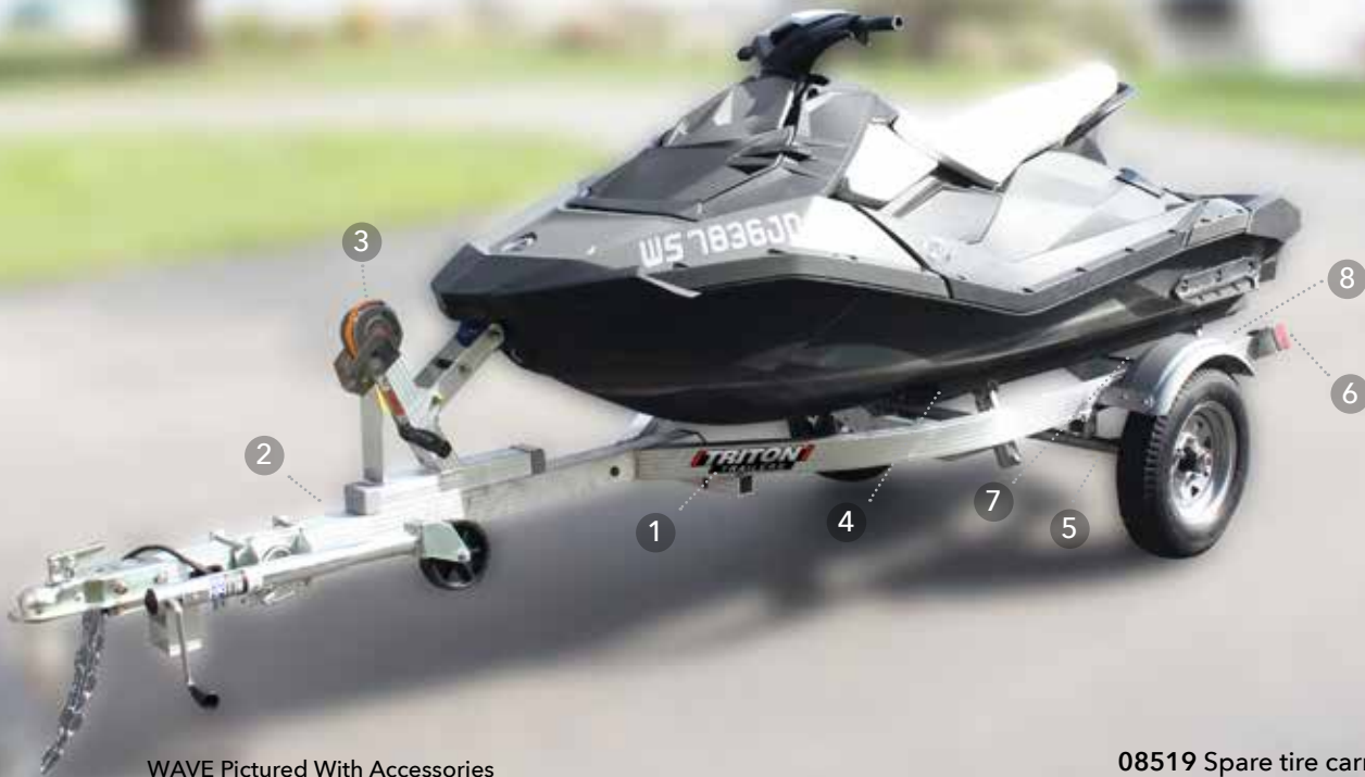
WAVE Pictured With Accessories

The WAVE Series is designed specifically for compact watercraft models such as the Sea-Doo® Spark®, Kawasaki® SX-R™ and Yamaha® EX™.