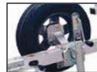
08519 Spare tire carrier (tire not included)