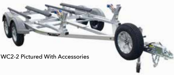
WC2-2 Pictured With Accessories