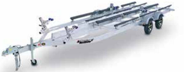
ELITE WCIV Pictured With Accessories