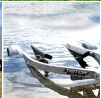
Personal Watercraft Trailers