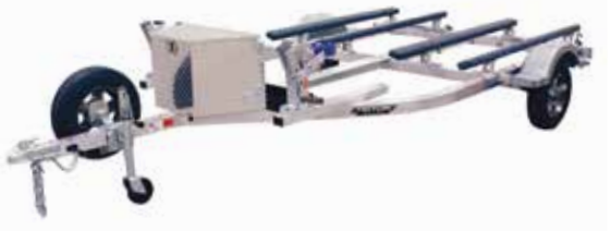
ELITE WCII Pictured With Accessories