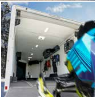
Multi-Season Enclosed Trailers