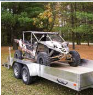
Off Road Vehicle Trailers