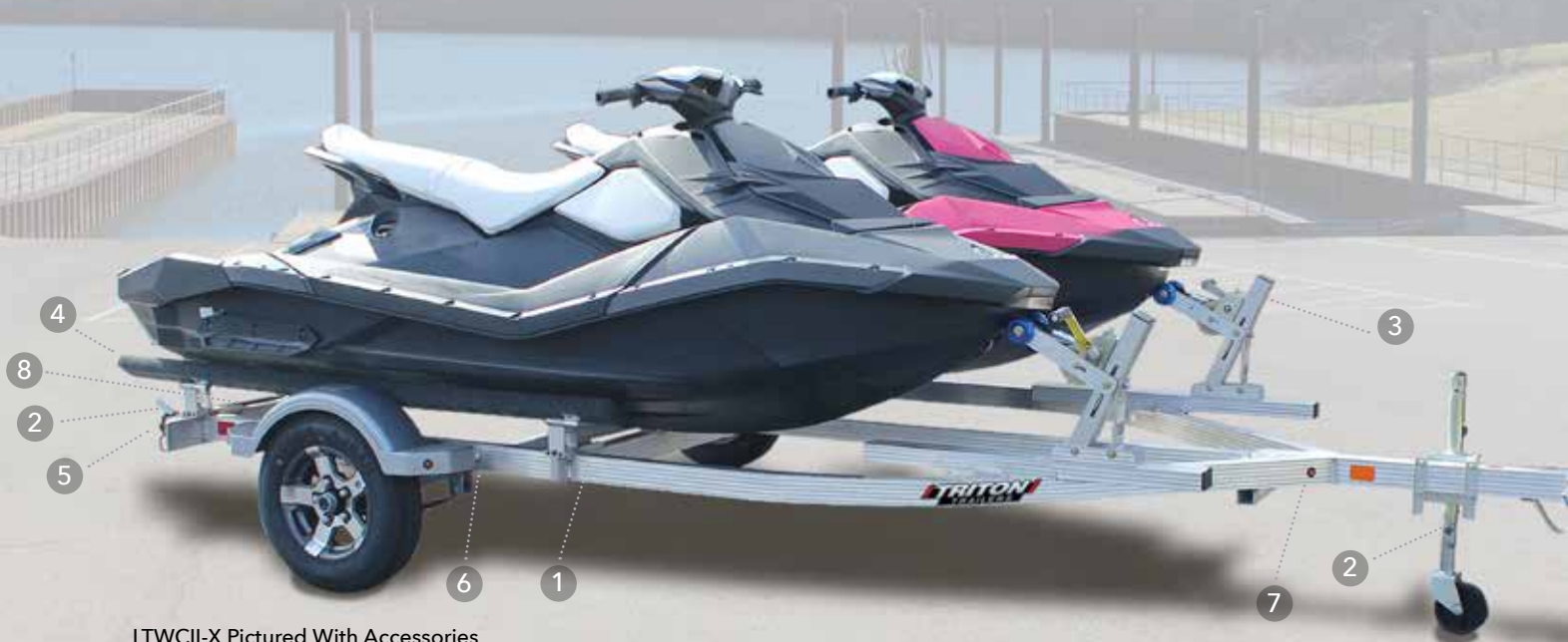
LTWCII-X Pictured With Accessories

LT Series trailers are designed to fit most one-, two- and three-seat watercraft models. Trailers are available in one place and two place configurations.