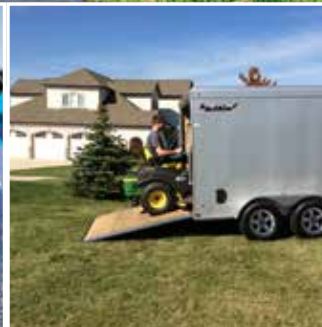
Cargo & Utility Trailers